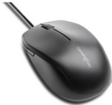
Kensington wired mouse