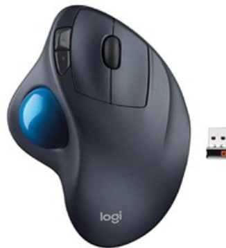
Logitech wireless trackball with scroll wheel